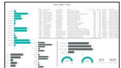
ALL OF YOUR SUPPORT REQUESTS AND PROACTIVE MAINTENANCE ACTIVITIES ARE TRACKED AND MANAGED