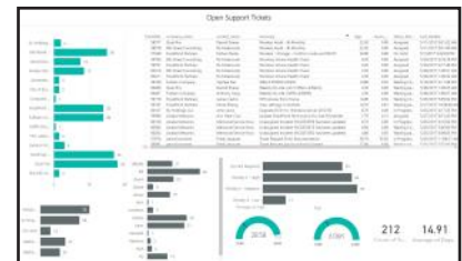
ALL OF YOUR SUPPORT REQUESTS AND PROACTIVE MAINTENANCE ACTIVITIES ARE TRACKED AND MANAGED