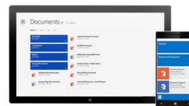
SHARE AND STORE DOCUMENTS ON ONEDRIVE FOR BUSINESS