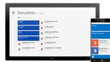
SHARE AND STORE DOCUMENTS ON ONEDRIVE FOR BUSINESS